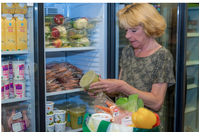
Information for Customers of the Voedselbank Houten

Our foodbank works like a 'supermarket'. All available products are placed on shelves and you choose what you need.